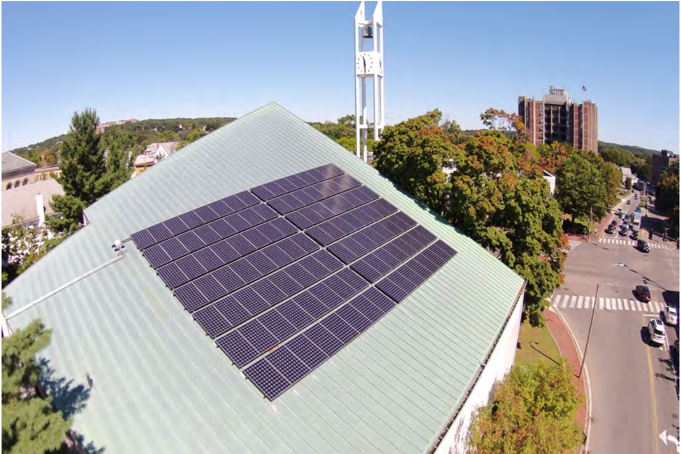
Curved copper standing seam roof

First Parish Arlington chose SunBug Solar to provide a solar energy system on their unique modern church. SunBug Solar won the competition with innovative design and the most attractive PPA.