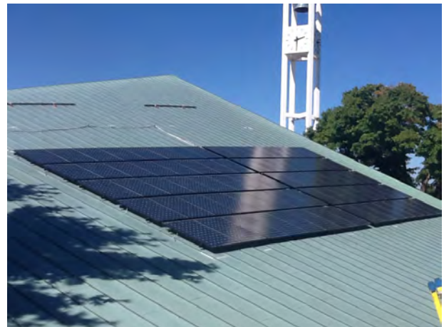
Convex roof on both axes