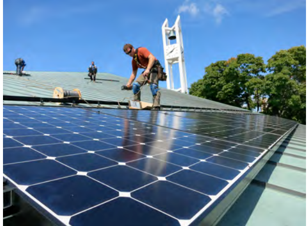
4-panel block sets