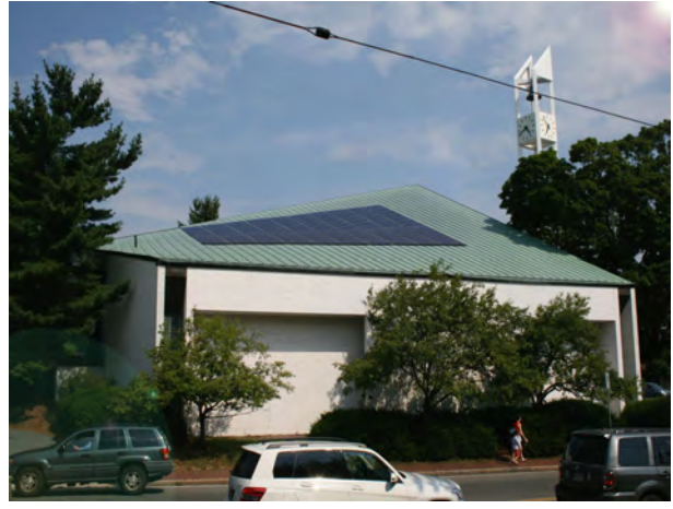
pre-construction layout mock-up