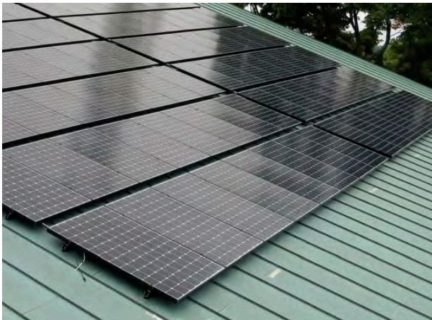
4 panel racks in 2 sets for 8 per half-row