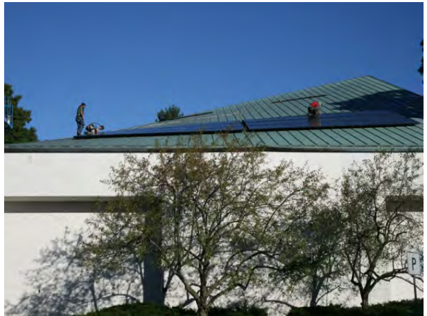
Convex roof on both axes